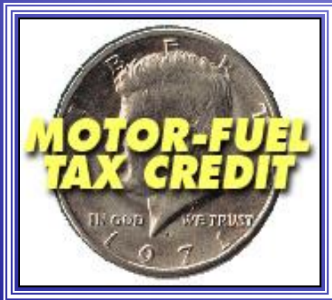
Propane Tax Credit Program