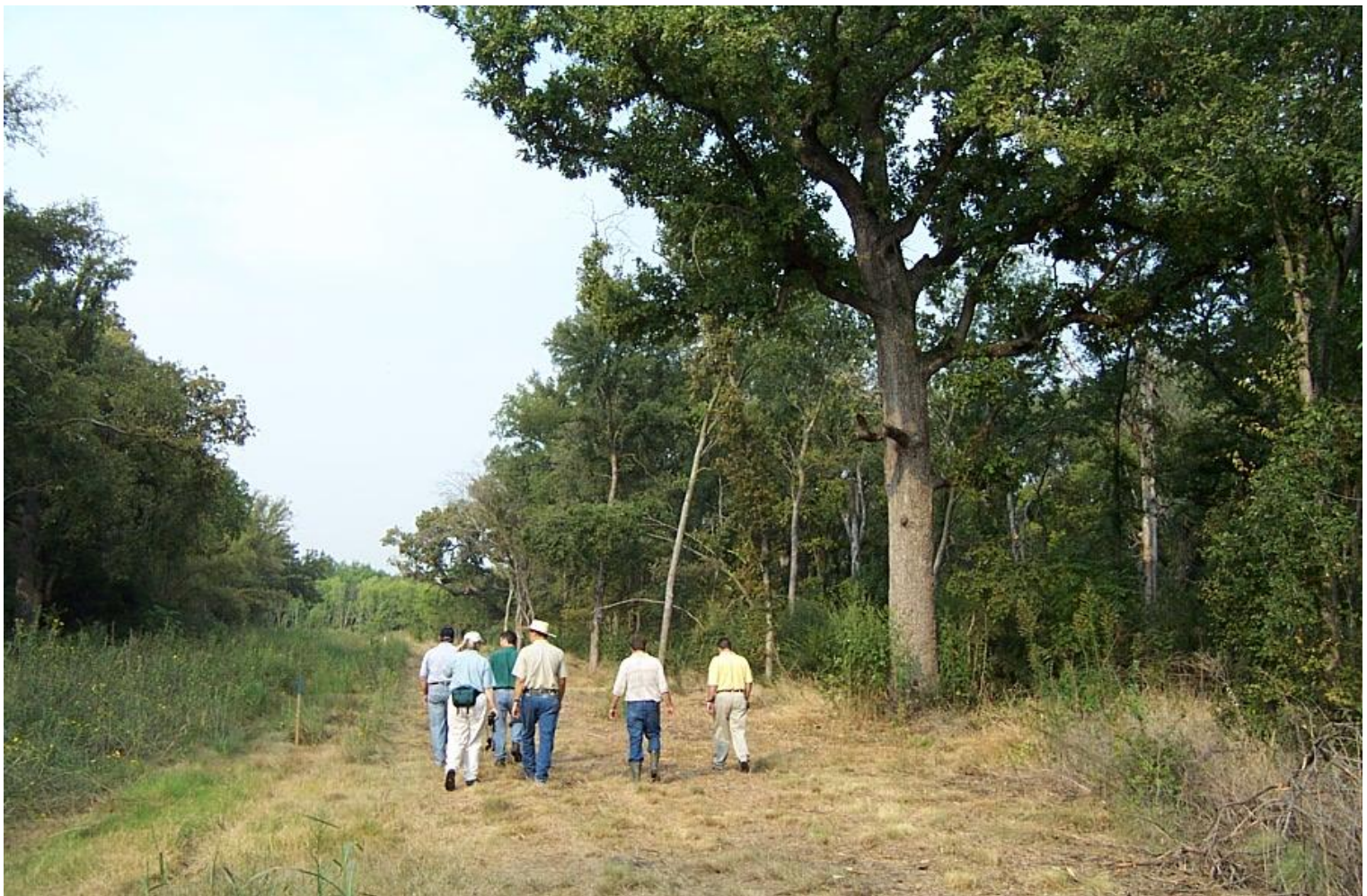
Sustainable Communities Conference